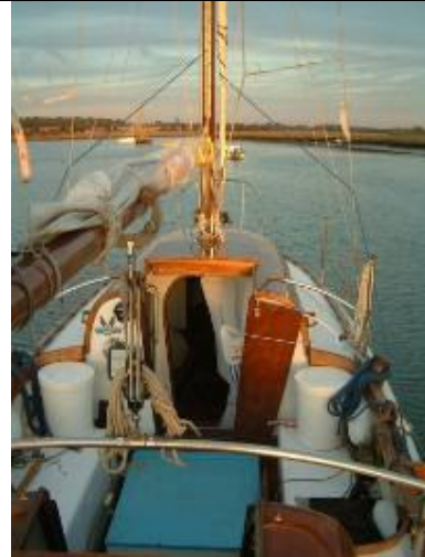
View from stern showing gas lockers companionway doors and large forward coach roof.