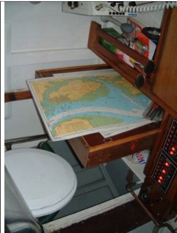
New DSC VHF has since been fitted and an enlarged chart table top has been added. Top lifts and provides storage. Tool storage under.