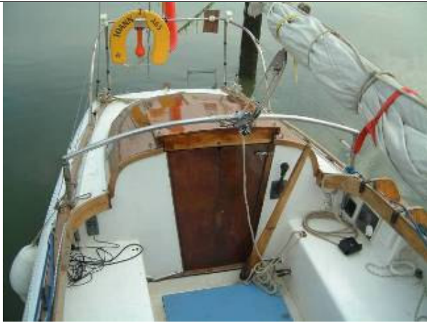
Aft cabin with whip staff steering and engine controls. Companionways fitted with bifold doors conventional washboards behind