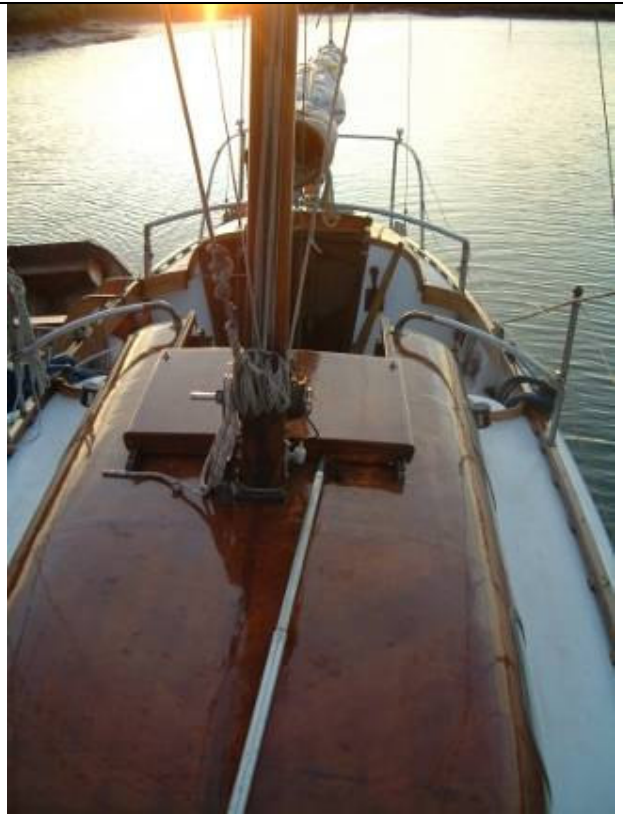
View from the bow. Coach roofs are epoxied and varnished over to protect finish.