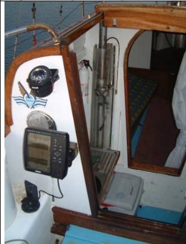
Hydraulics for port keel, compass and GPS sounder Nasa clipper log fitted since.