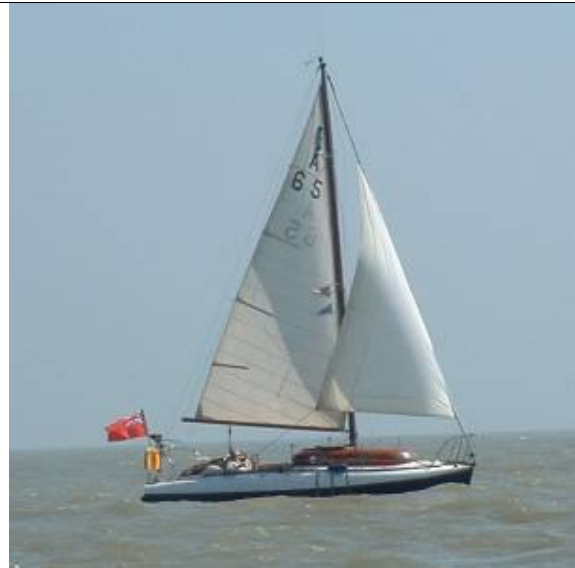
She doesn't float as low as the picture suggests! Deep safe cockpit with easy access when mooring or reefing.