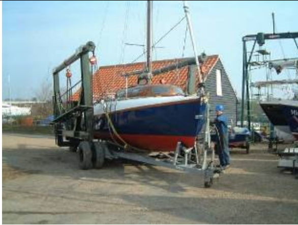
Joann being lifted from road trailer into club hoist for launching.